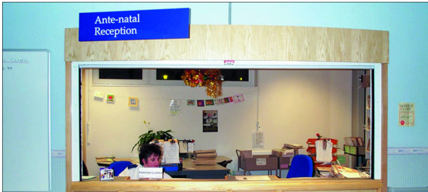
ENVIROGRAF® FIRE & SMOKE DROP CURTAIN INSTALLED AT RECEPTION DESK, ANTE-NATAL CLINIC, BURNLEY HOSPITAL