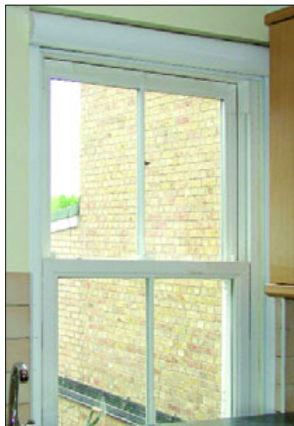
ENVIROGRAF® CURTAIN IN KITCHEN